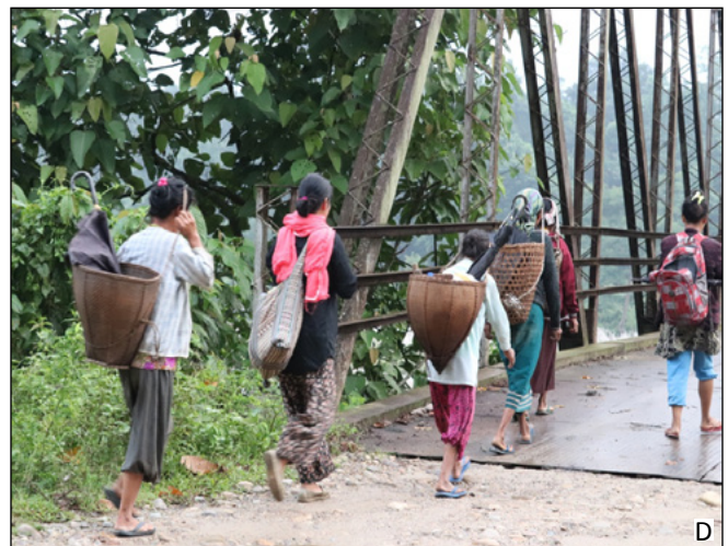
Plates 1-4: 1 & 2 traditional market near Seijosa forest area; 3: local person doing fishing; 4: Nyishi tribes collecting forest produce

systems. The efficient management of the selected species growing luxuriantly in the locally prevalent climatic conditions may become the source of regular revenue generation, particularly for the poor section of the community.